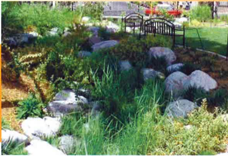
Figure 8. This rain garden consists of drought-tolerant annuals, perennials, and grasses.

plants including colorful annuals, grasses, and herbaceous plants (fig. 8).