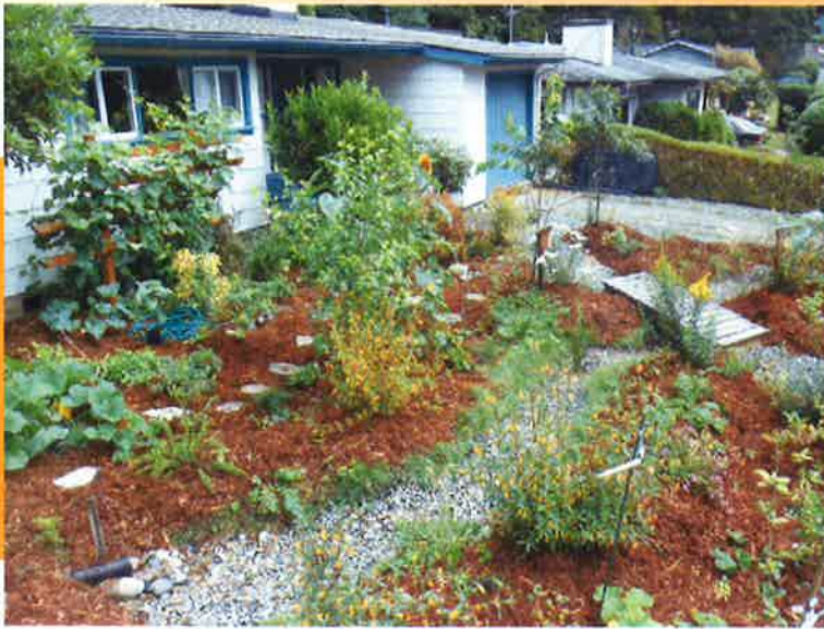
Figure 9. The thick mulch layer and diligent weeding will help avoid weed problems while plants mature. Plants include snowberry, douglas iris, luma berry, juncus (rush), sticky monkey flower, and yarrow.