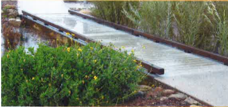
Figure 2. This rain garden demonstrates rainwater retention while making an attractive addition to the yard.