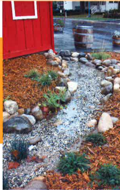
Figure 4. This newly planted garden makes it easy to see the downspout from the roof directing water to the garden. Stones are used to stabilize the area where water enters the garden and to prevent erosion.