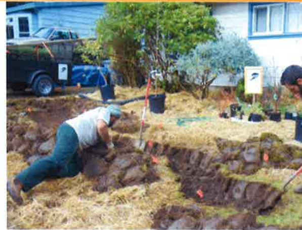
Figure 3. Removing a lawn and creating a channel for water flow.