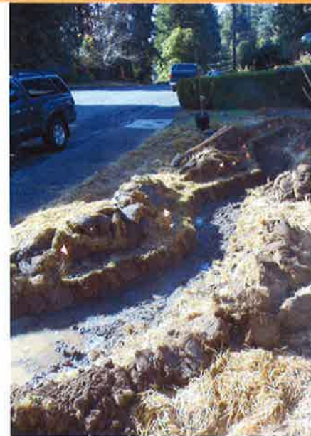
Figure 5. Gravel has been added to the bottom of the streambed during this construction in this home yard.