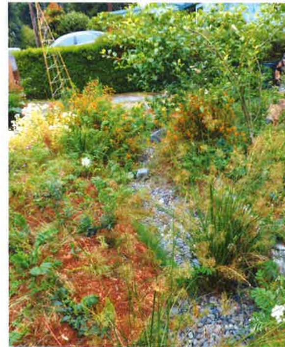
Figure 1. The gravel bed and meandering path of the dry streambed will hold water for a day.

Rain gardens collect rain that falls on a roof or other surfaces (fig. 1). The water is channeled via rain gutters, pipes, swales (vegetated depressions between two ridges), or curb openings into a depression in the yard, where it soaks into the ground and waters vegetation. A properly functioning rain garden holds water for only a short period of time; it is not a pond feature (fig. 2). Most of the time, the bed of the rain garden is dry. The purpose is to