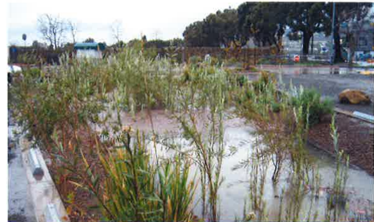
Figure 7. Runoff from surrounding areas flows into the rain garden basin, inundating the plants in this public landscape and parking area.

a good option since they are well adapted to seasonal, short-duration water supply and long periods of drought. Different types of plants may be necessary for the rain garden. Plants located on the base and the sloped sides of the garden will need to be selected from species that can withstand complete inundation as well as extended drought conditions. Plants on berms will not need to tolerate extended wet conditions, so this area can be planted with a variety of drought-tolerant or native