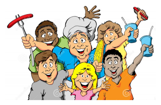
Make the Best of Your Fair Experience

Come and enjoy food, friends and fun. Please come and join us on Thursday, July 6th for a Countywide 4-H BBQ at Florence Keller Park. If your last name starts with A-M, please bring a side dish. If your last name starts with N-Z, please bring a dessert. There will be food, games and other activities to enjoy. If you have any questions, please call the 4-H office at 707-464-4711.